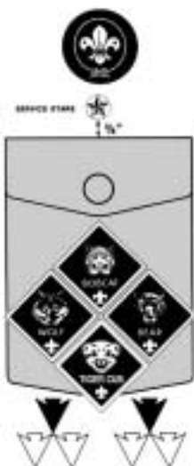
CUB SCOUT LEFT POCKET